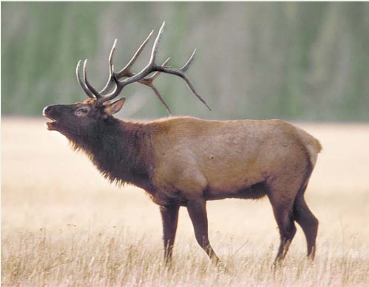
Bull elk, Yellowstone National Park