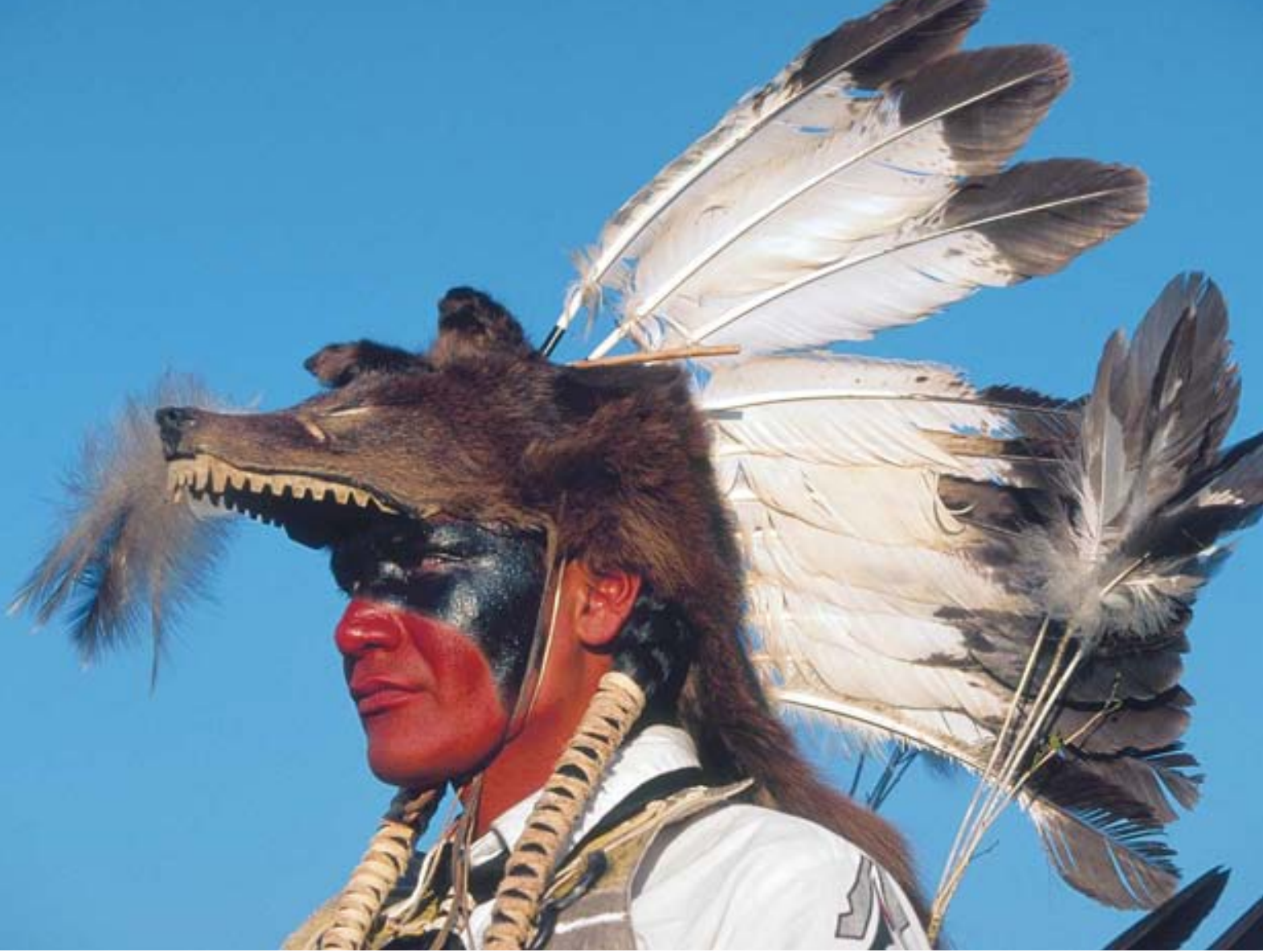
Indian Plains Powwow participant in wolf headdress, Cody, Wyoming. Many Native American traditions honor wolves.

generalized predators to increase their numbers, range and exploitation of food sources. For example, when gray wolves were eliminated, coyote numbers exploded. Similarly, elimination of red wolves from the southeastern United States was followed by an increase in coyotes and raccoons, which in turn caused a reduction in wild turkeys (Miller et. al. 1997).