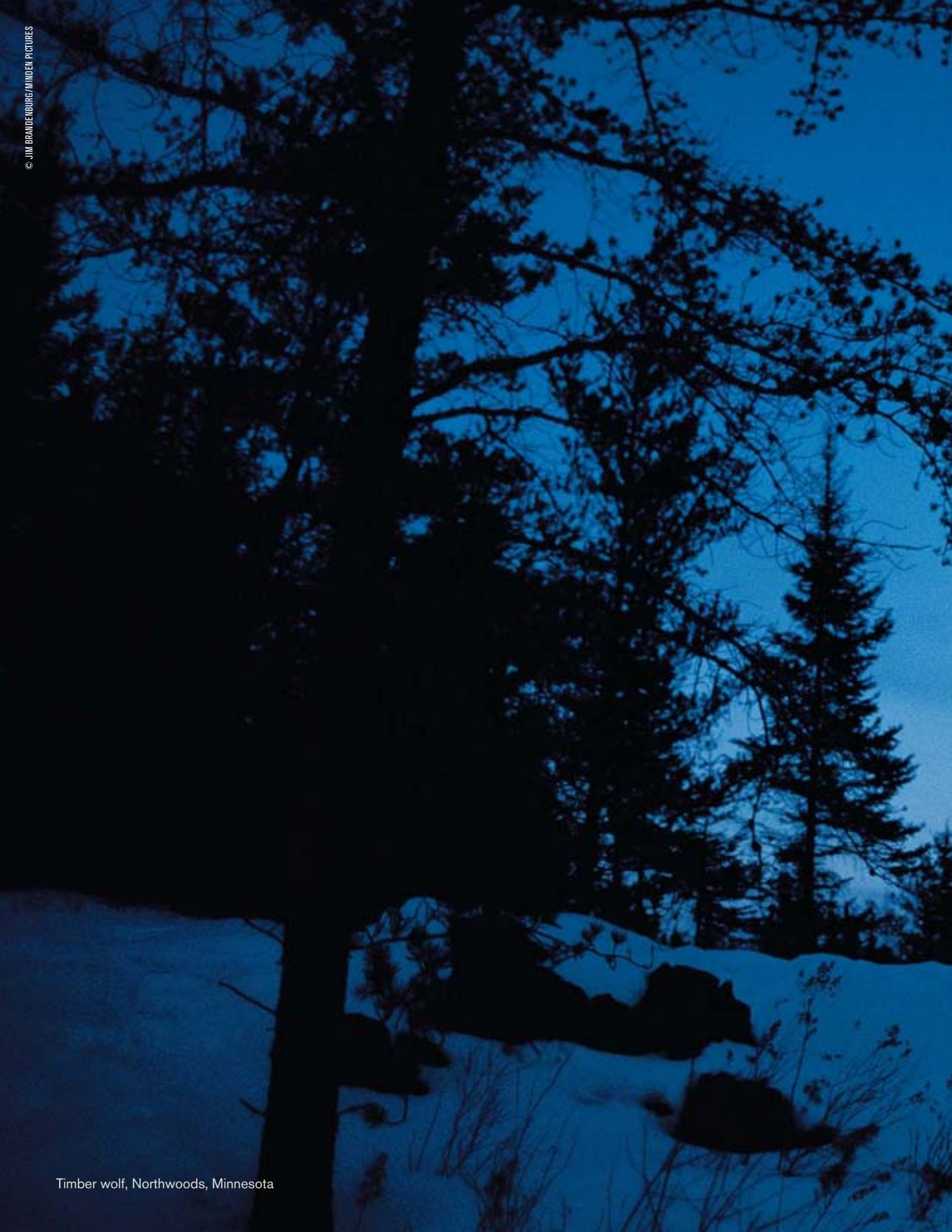
Timber wolf, Northwoods, Minnesota