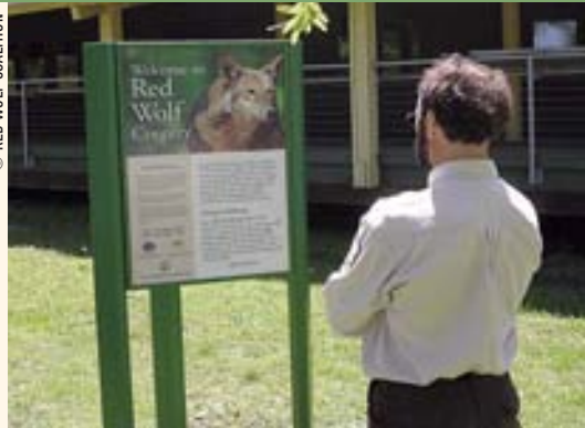
Learning about red wolves, North Carolina