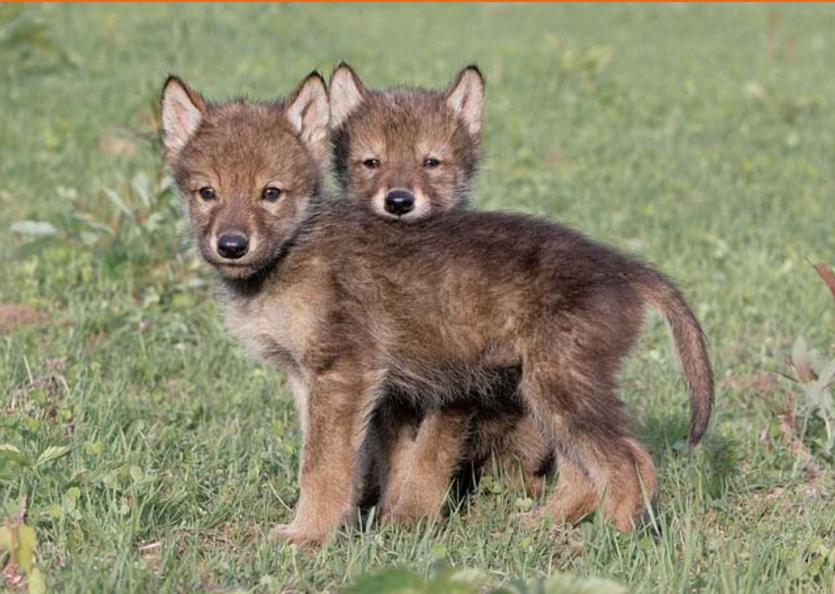
Wolf pup siblings, Minnesota

D espite the laudable success of wolf recovery efforts to date, many areas with suitable wolf habitat remain devoid of wolves today. Indeed, only a fraction of the potential that exists for restoring wolves and the ecosystems to which they belong has been met.