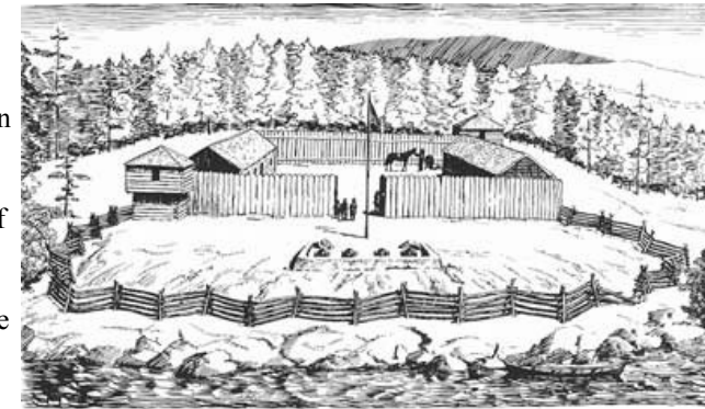
The Rendezvous assemblage

who crossed the continent with their husbands to establish a mission in Oregon. They were the first white women to blaze the way for the thousands to follow their brave example.