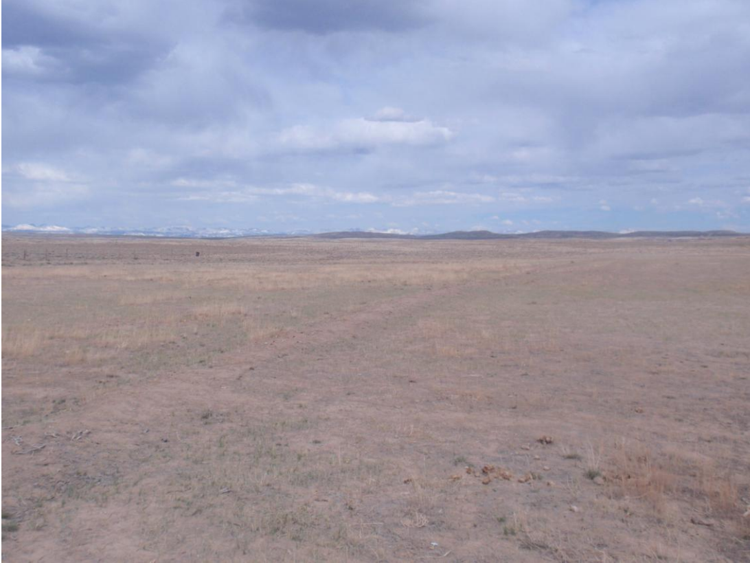
143 Chizzler Road borders BLM Public Land