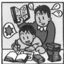
Can somebody help m with this math????

Have you noticed the new playground equipment at the school?