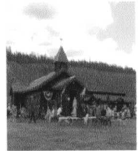
ANNUAL GATHERING LAST SUNDAY IN JUNE