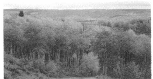
Bondurant fall colors from Aspen Ridge, Sept 16, 2006