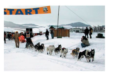
2004 IPSSSDR Pinedale Stage Stop Race

It's time again for the IPSSSDR. This alphabet soup name stands for International Pedigree Stage